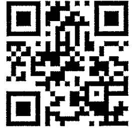
Saviour Lutheran School Website

For any enquiries, please contact class teachers at 27293929.